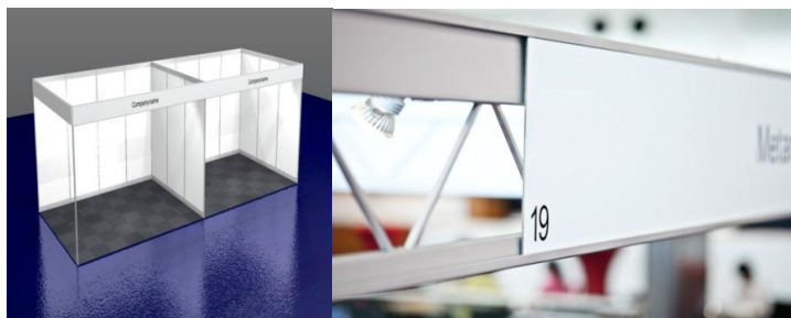
Photo impression shell scheme. Other options are possible.